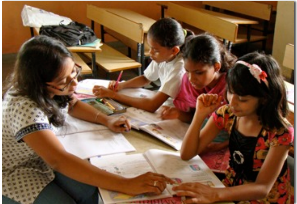
MAD volunteer working on English skills with three of our students